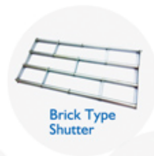
Brick Type Shutter