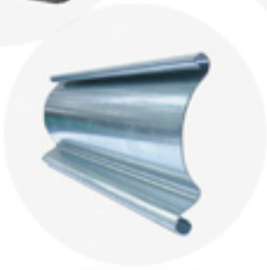
MS / GI Slat