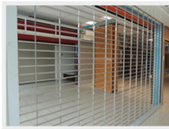
Grill Type Shutter