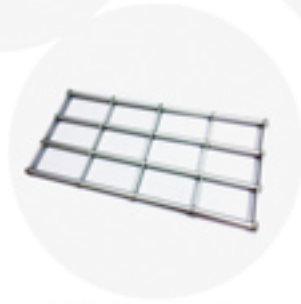
Link Type Shutter